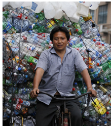
Plastic Planet, Werner Boote, 2009

This Season of European Documentaries developed by the Institut français du Royaume-Uni has, since 2007, been showcasing the work of emerging as well as established filmmakers from across the continent, exploring a wide variety of topics such as 'memory' or 'environment'.