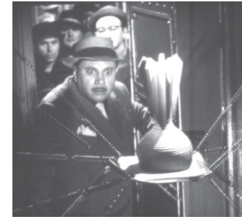
S-A FURAT O BOMBA, Ion Popescu-Gopo, 1961