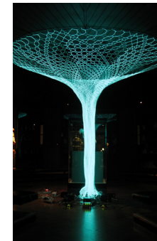
Studio Loop.pH 2009

This imaginative exhibition, organised at the Victoria & Albert Museum in 2009, showcased works by 21 European designers who creatively explored the potential of low-energy lighting, alternative energy sources and the way we think about light and darkness.