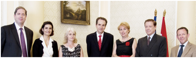
CD Seminar 2010, Reception at the Hungarian Embassy