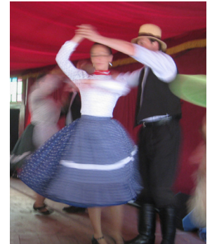
H-UNique, HCC, 2011

Celebrating the European spirit in a very entertaining and open way, Spiegeltent hosted a colourful series of events, organized by the Flemish Representation in the UK, together with the EC Representation in the UK and EUNIC London in Regent's Park in May 2011.