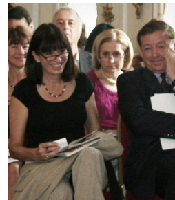
CD Seminar 2010, Romanian Cultural Institute

First initiated by the Hungarian Cultural Centre in 2010, the seminar has been successfully exploring the emergence of the concept of cultural diplomacy. The 2011 edition explores the strategic perspectives of the arts and cultural world for the 21 st century with an open, cross-disciplinary approach.